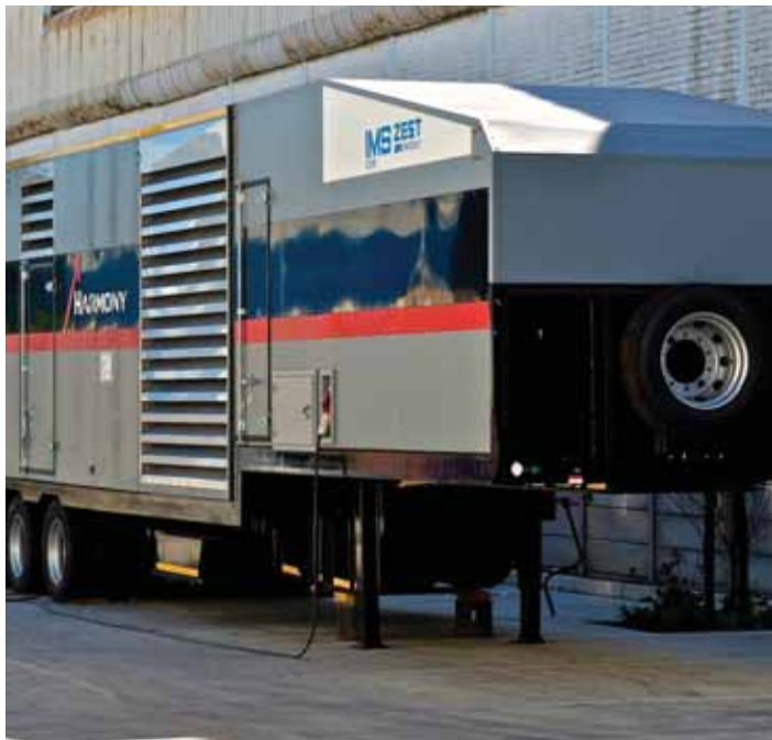
MOBILE DIESEL POWER GENERATION

In addition to this and as part of our organisation's strategy, Zest Energy aligns itself with other reputable and experienced technology partners. Zest Energy then works closely with these partners to successfully achieve the objectives of the project at hand. With the many years of experience accessible through the association with these technology partners and those resources now available within Zest Energy, a successful strategy is in place that will allow the organisation to take on all types of project work in the power and energy industries.