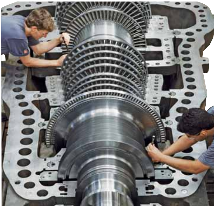
COMPLETE STEAM TURBO GENERATOR SETS

The trademark of the company is their commitment to service excellence and continuous improvement of all people and service offerings. By virtue of the fact that Zest Energy is focussed on their mission and vision, the organisation remains dedicated to becoming the leading integrated power generation and energy solutions business on the African continent.