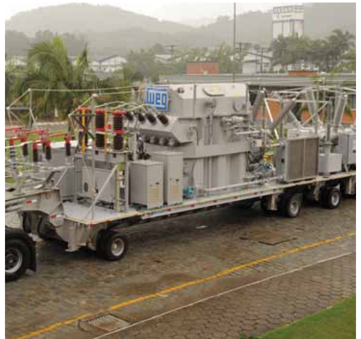
WEG MOBILE SUBSTATION SOLUTIONS