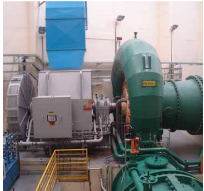
WEG HYDRO GENERATOR SETS